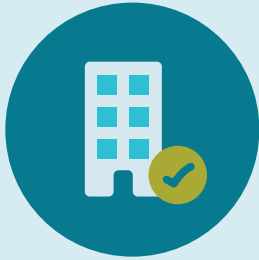
PREPARE THE BUILDING