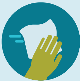
REDUCE TOUCH POINTS