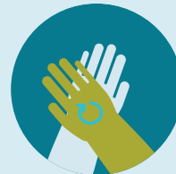
BACK OF HANDS