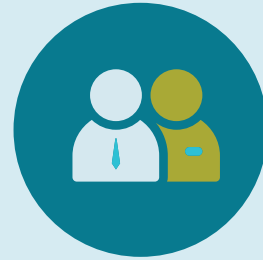
PREPARE THE WORKFORCE